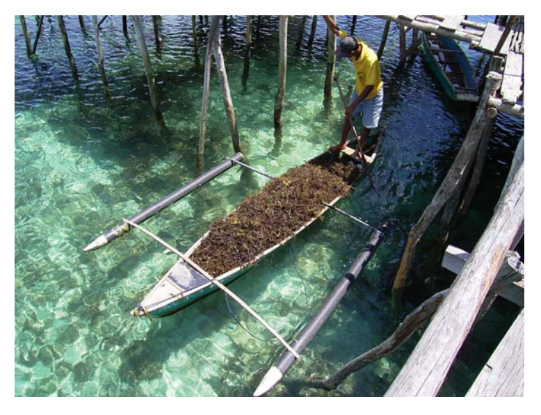
Seaweed farming in Tun Sakaran Marine Park

Other opportunities lie in existing and planned mariculture operations. Seaweed culture has been established for decades and has expanded in recent years because of high market prices and relatively low entry costs. Culture and farming of marine invertebrates also has potential, and development within this sector was the second theme within the alternative livelihoods part of the current Darwin project. Progress on this is described in Section 3.