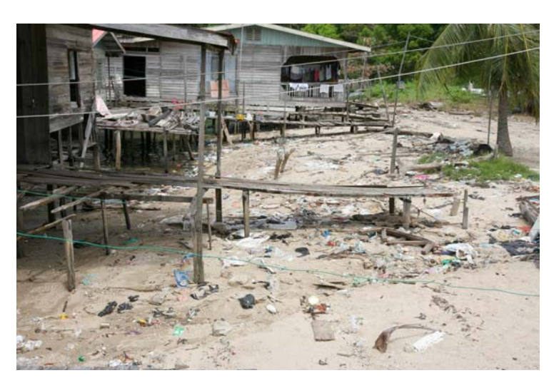
Pulau Selakan currently has a problem with rubbish and its disposal

In order for Homestay at Selakan to become a reality there need to be significant improvements to the infrastructure on island, the including sewage treatment (proper flushing toilets and septic tanks) and repairs to the wooden jetty. There would also have to be a major rubbish clean up on the island and a strategy implemented for proper rubbish disposal in the future. Boats and boat drivers also have to be licensed in accordance with Sabah state regulations.