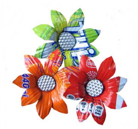
Recycled metal daisies made from drink cans - an example of how waste items can be used to make saleable items

Waste materials such as plastics and aluminium drink cans are in plentiful supply and there is considerable scope for the local community to use these freely available materials to make items such as jewellery, souvenirs and toys. One of the main complaints made by visitors to the Park is about the amount of litter on the islands and in the sea, so it is likely they would support an initiative that put some of the waste to good use.