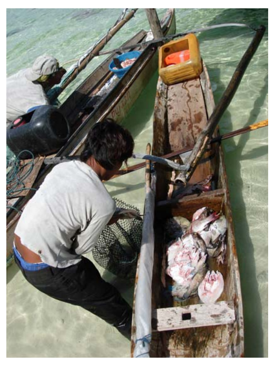
Fisherman bringing in catch in Tun Sakaran Marine Park

The focus for the alternative livelihood programme in the Park therefore needs either to be directly with the Bajau Laut and/or fish dealers or with other communities who might open up job opportunities for the fishing community.