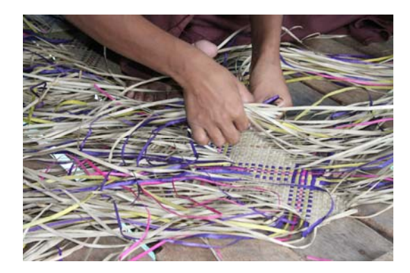
Production of mats at Kg Boheybual, Tun Sakaran Marine Park

front cover) are large and would be too bulky for many visitors to consider buying. They are also quite expensive due to the fact that each one requires months to make. One mat (full colour) roughly 1.5m x 2m takes one lady about 2 weeks to produce and involves an outlay cost of at least RM20-30 for materials (dyes and pandanus leaves). The price asked by the Bajau Laut is about RM 350 (£80) which is more than many visitors would want to pay, even though it is more than justified given the amount of time involved in its creation.