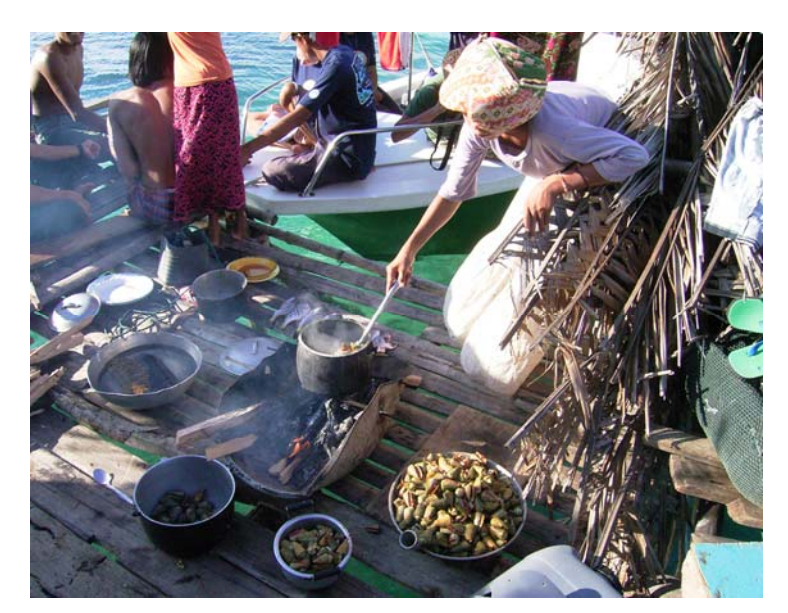
Bajau Laut community in Tun Sakaran Marine Park, preparing locally-caught fish and shellfish

As part of the endeavour to encourage alternative livelihoods within the tourism sector, the Semporna Islands Darwin Project looked more closely at two possible activities that had been flagged up by the local community - Homestay and Craftwork. These are discussed in the following sections.